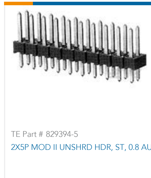
TE Part # 829394-5 2X5P MOD II UNSHRD HDR, ST, 0.8 AU