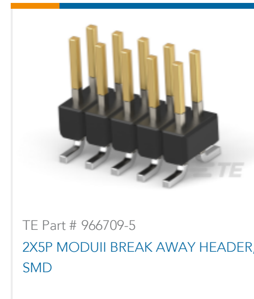
TE Part # 966709-5 2X5P MODU II BREAK AWAY HEADER, SMD