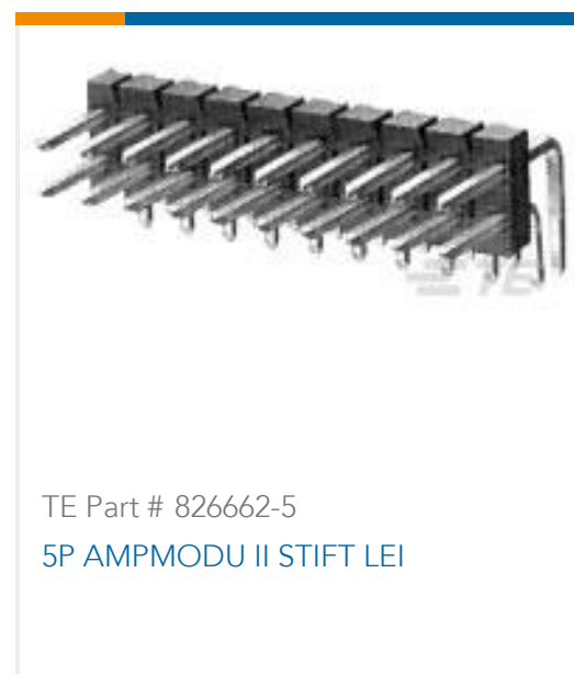
TE Part # 826662-5 5P AMPMODU II STIFT LEI