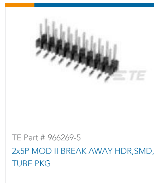
TE Part # 966269-5 2x5P MOD II BREAK AWAY HDR,SMD, TUBE PKG