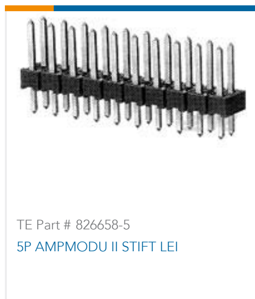
TE Part # 826658-5 5P AMPMODU II STIFT LEI