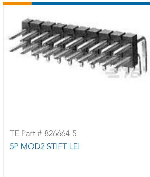
TE Part # 826664-5 5P MOD2 STIFT LEI