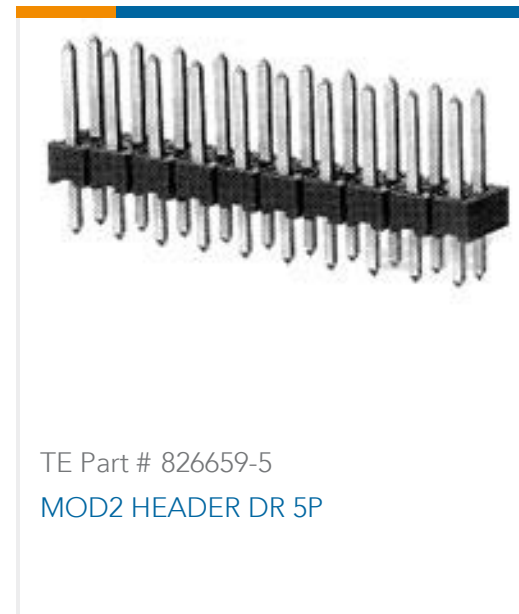
TE Part # 826659-5 MOD2 HEADER DR 5P